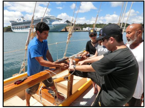
Actual voyaging canoe of “Namahoe” at KCC

Since 2020, we have developed and started the alternative online program because of COVID-19. The program was held for three times from 2021 to 2023, and 49 students in total have joined.