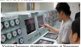
Visiting Japanese shipping company at Singapore