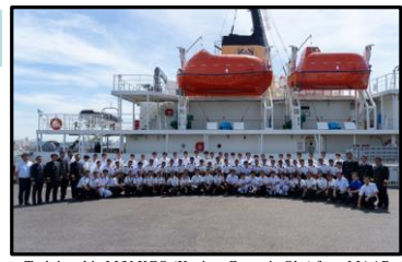
Training ship M/V KGO (Kapitan Gregorio Oka) from MAAP

MAAP has developed the global educational programs such as “Maritime English Seminar” and “the short cross-cultural Onboard Training” (see photos). The partner maritime academy, NTMA and MMMA are included as other international exchange parties. NTMA & MMMA were established by major Japanese shipping companies. As shown in the table, the participants are increasing gradually because it is a affordable price in the Philippines. The five maritime KOSENs have developed the English training and global internship program in the Philippines which is affordable for Japanese maritime students. The collaboration programs was successful.