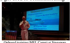
Onboard training (MEL Camp) at Singapore

Also, the students had a chance to visit Japanese shipping companies in Singapore. During the MEL Camp, the students took onboard a large cruise ship and participated in the lessons and workshops with SMA students.