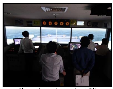
Maneuvering simulator training at SMA